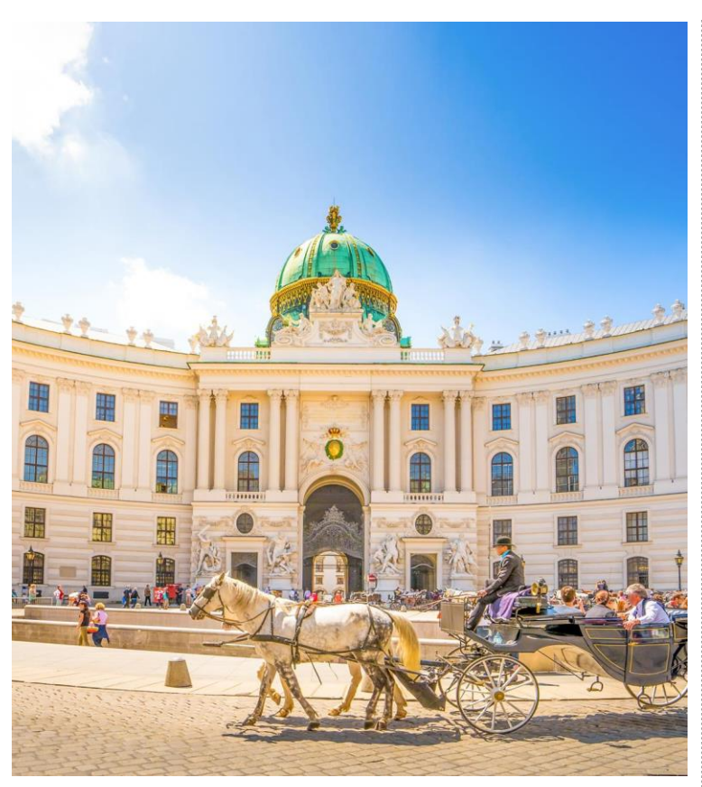
11 Days • 14 Meals: 9 Breakfasts, 1 Lunch, 4 Dinners

HIGHLIGHTS... Prague, Prague Castle, Cesky Krumlov, Vienna, Schönbrunn Palace, Classical Music Performance, Choice on Tour, Bratislava, Lunch with Locals, Budapest, Matthias Church, Fisherman's Bastion, Visegrad, Renaissance Dinner