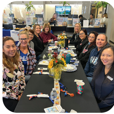
Training Breakfast at ECSFCU

Join us for the East County Schools FCU Annual Meeting, Wednesday, February 19, 2025 at 5:15 p.m. The meeting will be held as a hybrid event both in person in our El Cajon branch lobby at 1069 Graves Avenue, and as a Zoom event. The Board of Directors election results and highlights of our accomplishments will be presented. All member-owners are welcome to attend. Information on how to connect to the Zoom meeting can be found at EastCountySchools.org/annualmeeting .